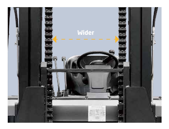
The new design mast provides broad forward visibility due to outside located hydraulic pipes of fork positioner.

In addition to the soft landing system, the soft lifting system is adopted (front lifting cylinders of triplex mast and full free duplex mast), as a result, the noise and shock of the mast significantly decreases.