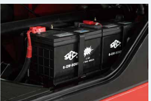
The battery is located above the fuel tank, there's battery box and adiabatic plate between them to prolong the battery's workling life.