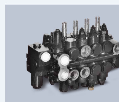
Add return oil filter of gearbox and multi-valve, improving the cleaness of transmission and hydraulic oil..