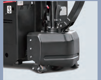
Additional Wheels are Equipped to Increase Stability