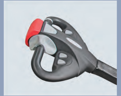
Rema Multi-Function Tiller Head