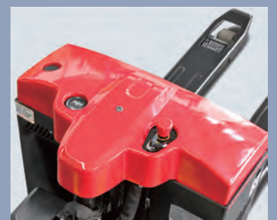
Modern Industrial Design