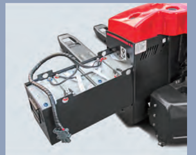
Battery Side Roll Out